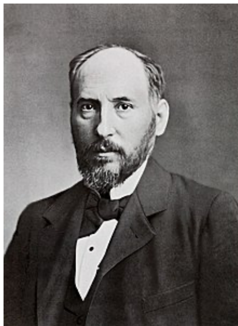
Ramón y Cajal

In fact, the idea of neurons connecting in ensembles is over one hundred years old. In the lab of Santiago Ramón y Cajal, the neuroscientist who first identified neurons as the basic unit of the nervous system, discussions of “chains” of neurons were common. Next, it was Hebb who introduced the idea of a neuronal assembly. Importantly, however, ensembles are non-Hebbian – they don’t rely on plasticity to form.